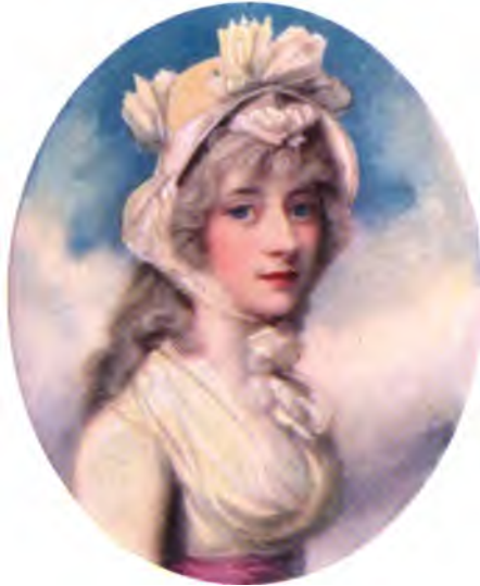
THE VISCOUNTESS ANSON, SECOND DAUGHTER OF THOMAS WILLIAM COKE, FIRST EARL OF LEICESTER